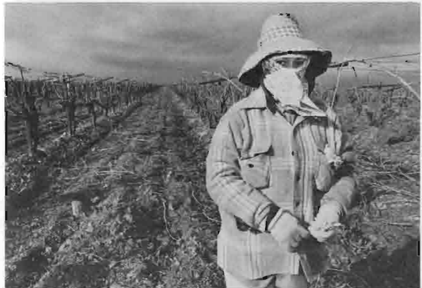
Grape workers have been especially hard hit by Gov. Deukmejian's political alliance with corporate growers.