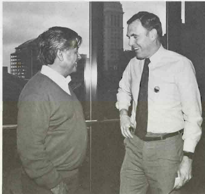
With Mayor Raymond Flynn at his Boston City Hall office.