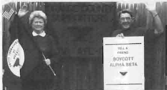
Showing the flag in Orange County.