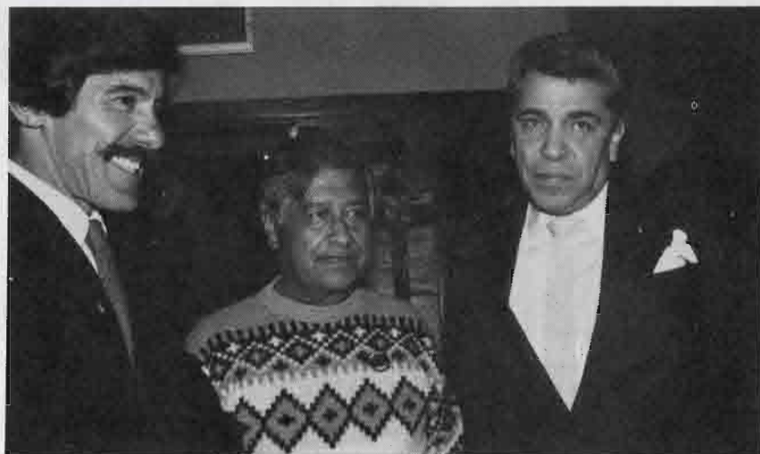
TV personality Geraldo Rivera emceed New York fundraiser to support the UFW table grape boycott. At right is State Congressman Robert Garcia.