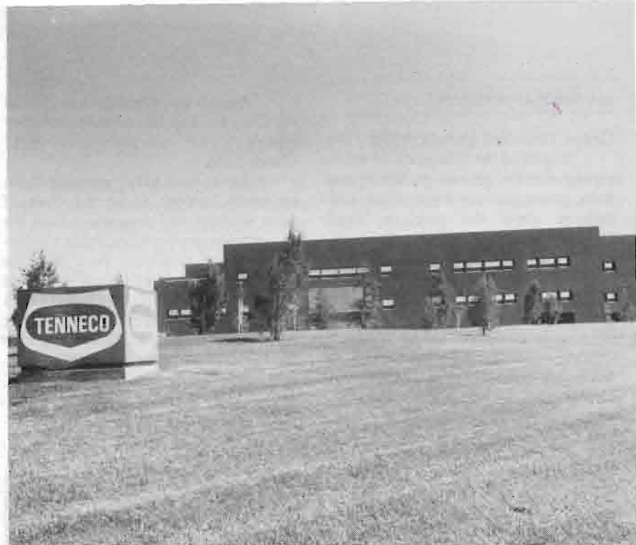
Corporate grape growers like Tenneco and Giumarra Vineyards are the worst offenders in the reckless use of dangerous pesticides.

Even though pesticides, more than any other environmental problem, pose a greater threat to the lives and