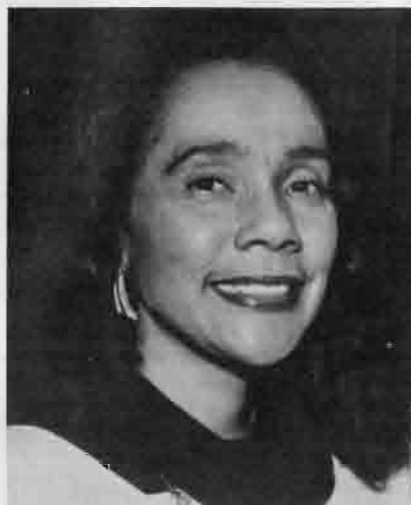
Coretta Scott King

"I am delighted with your visit and am pleased to give you our endorsement of your boycott," Huerta was told by King, president of the Martin Luther King, Jr. Center for Nonviolent Social Change.