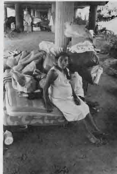
Farmworkers' living conditions are worse than ever. Here, pregnant woman makes temporary home under bridge with more than 100 families.

problem of pesticides. Workers complained that crews were sent into the fields too soon after sprayings, that victims of mass crew poisonings have been threatened with dismissal for seeking medical help, and that growers and foremen intentionally disregard regulations concerning the safe use and storage of pesticides.