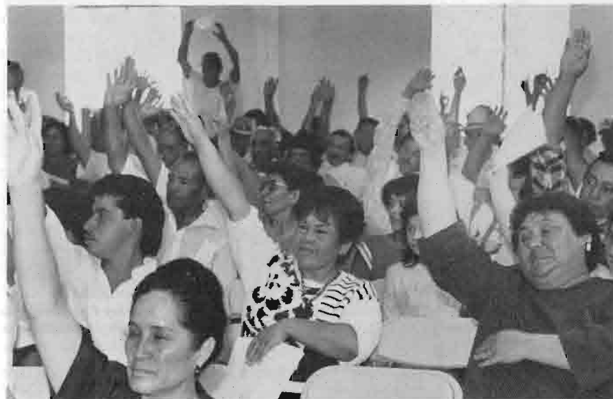
Grape workers vote for resolution during the conference in Delano. The conference was held by the UFW after workers asked the union to help them change the worsening conditions in the fields.