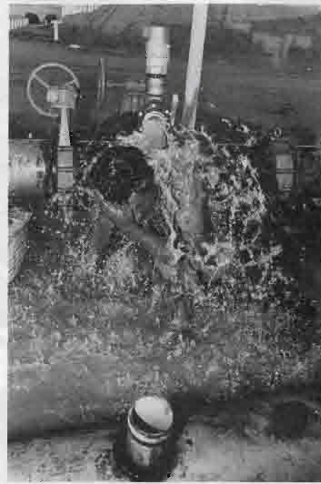
After a hard day in the field, worker takes a makeshift bath in pesticide contaminated water from an irrigation pipe.